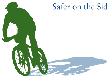
Safer on the Sidewalk

What are the laws in RI about bicyclists on sidewalks? What can I do to have a better bike path/bike lane experience?